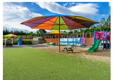
Preschool & Nursery, Selwyn